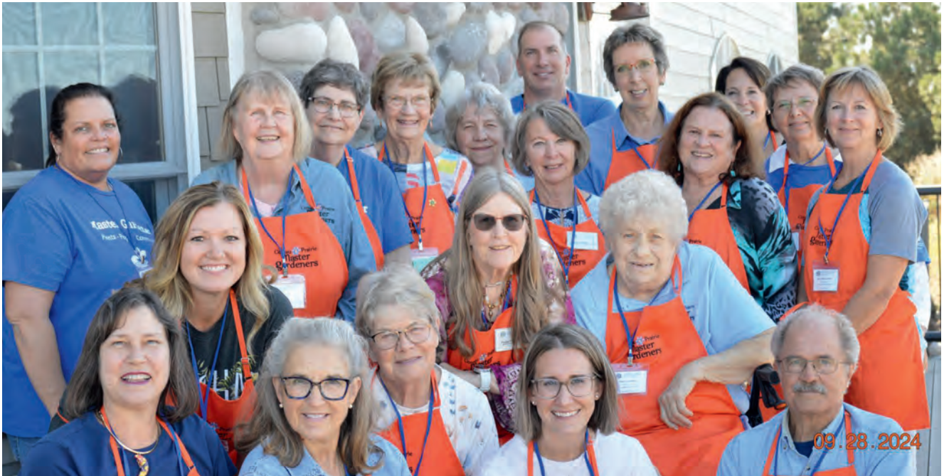
Coteau Prairie Master Gardener Club (Watertown area) hosted the 2024 state conference at Joy Ranch.