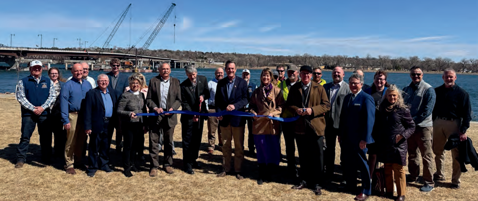
Local, state and federal officials celebrate the ribbon-cutting of the new Lieutenant Commander John C. Waldron Memorial Bridge, March 25, 2025.